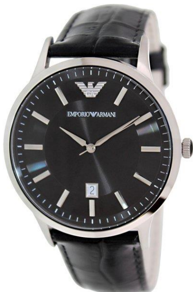
Emporio Armani Men's Super Slim AR2411 Black Leather Analog Quartz Watch.