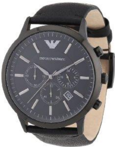
Emporio Armani Men's Sportivo AR2461 Black Leather Analog Quartz Watch.